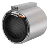
Axial closed cooling

This new cooling concept brings the added value of direct drive torque motors to more applications with minimal efforts allowing a shorter time to market and lower costs.